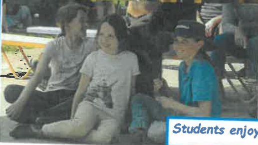
Students enjoying their PETS!