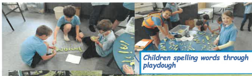
Children spelling words through playdough

All students are bringing 2 letters home today – a class letter and Athletics info. Keep an eye out!