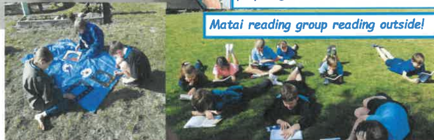
Matai reading group reading outside!